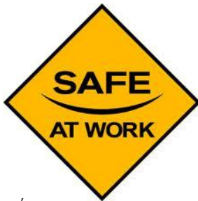
Safety At Work