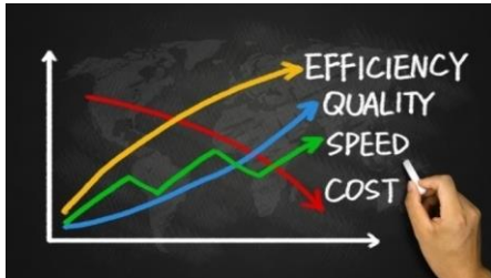
Project and Cost Management

The SCON CONSULTANTS team always deals with