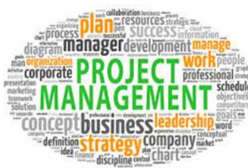
Project Mgmt. Consulting